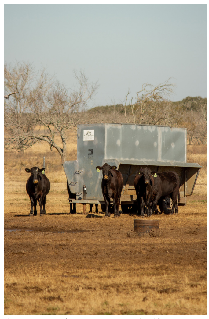
The USDA reports that pasture, rangeland and forages cover approximately 55% of all U.S. lands.

If a loss occurs, payments are processed automatically without having to submit a claim. Any indemnity owed is first deducted from the premium before a cash payout.